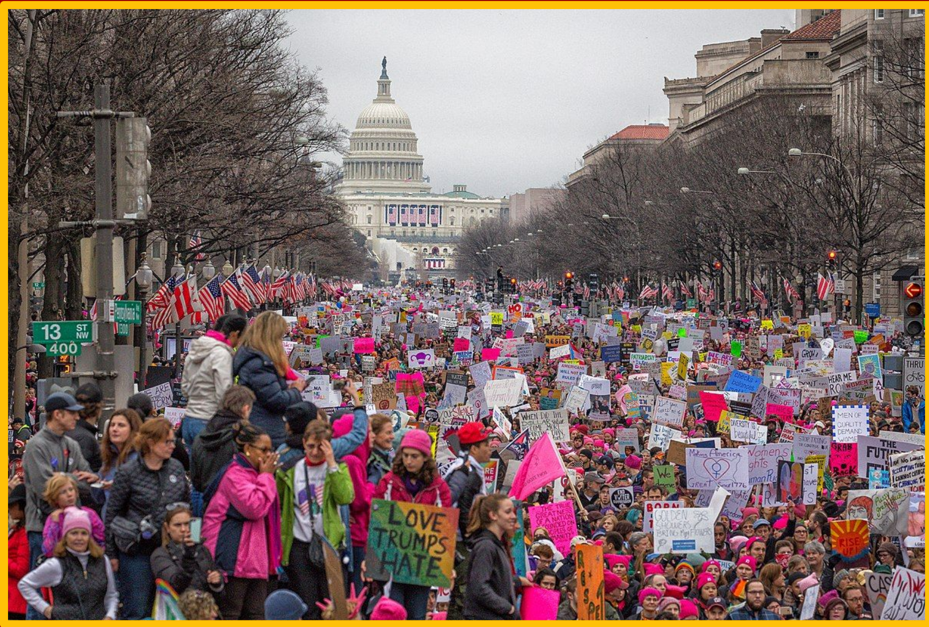
Figure 2: Women's March, January 21st, 2017