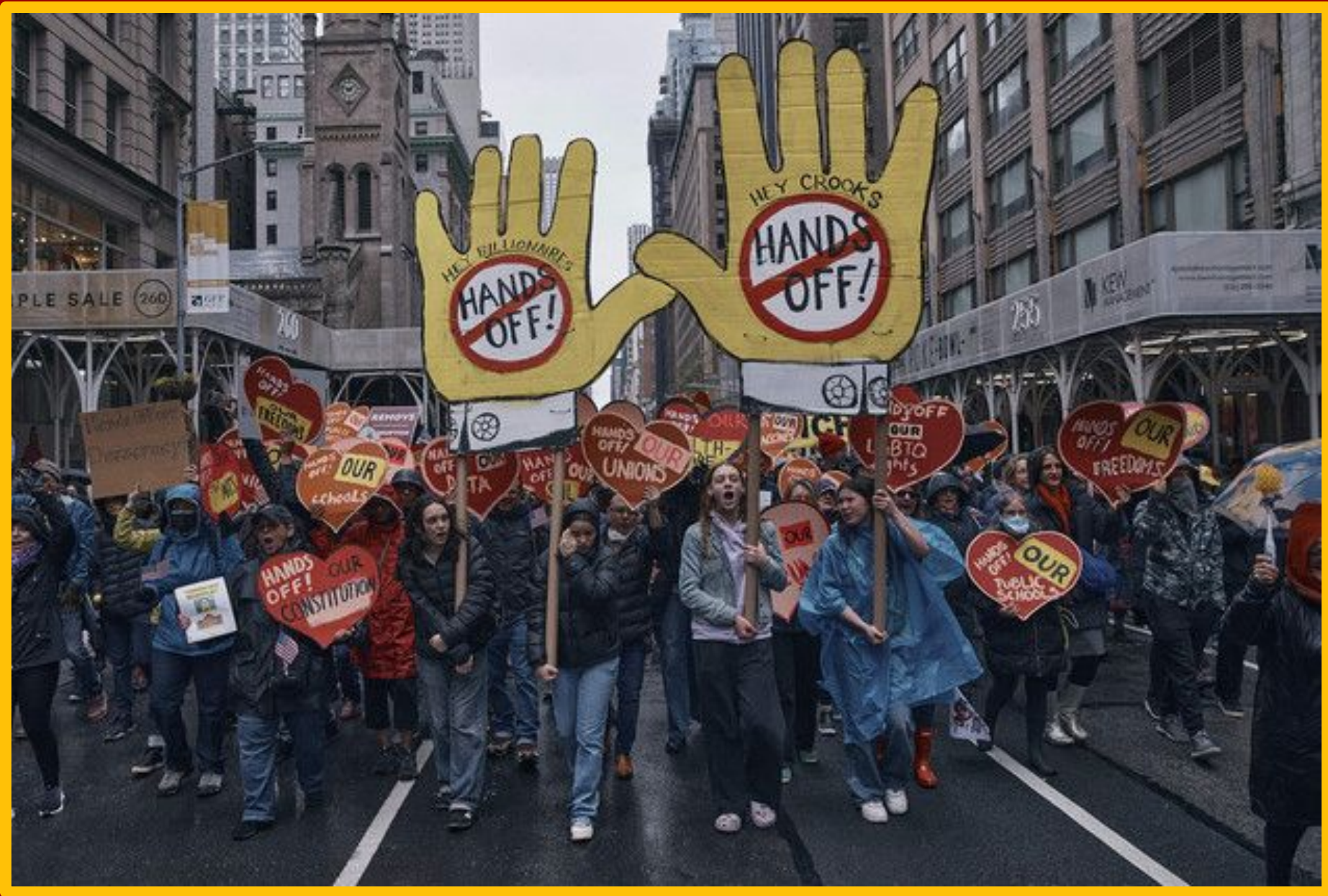
Figure 3: Hands Off March, April 5th, 2025