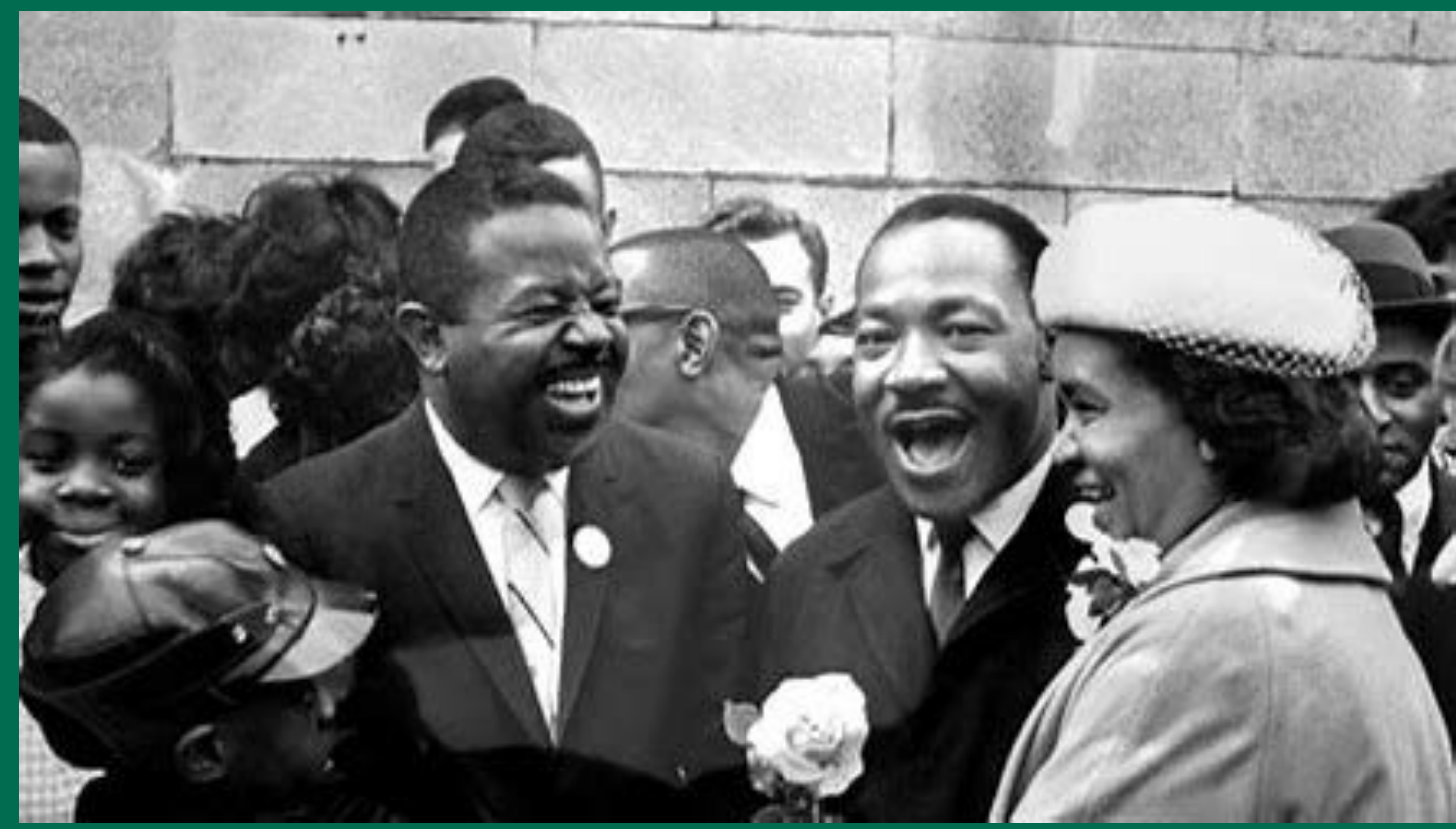
Martin Luther King Jr. conversing with Johnnie Tillmon and Ralph Abernathy, two guaranteed income advocates who worked with King