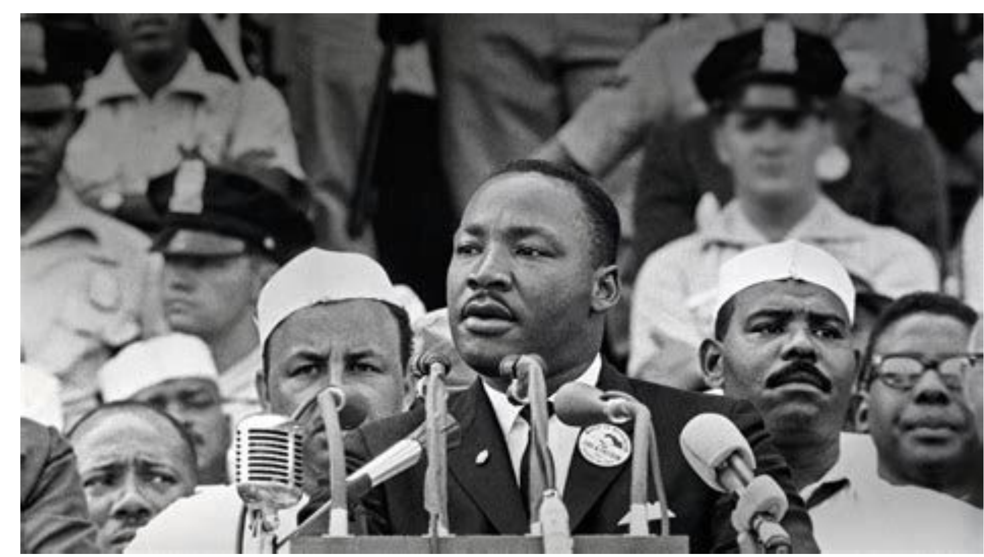
MLK giving his “Beyond Vietnam” Speech