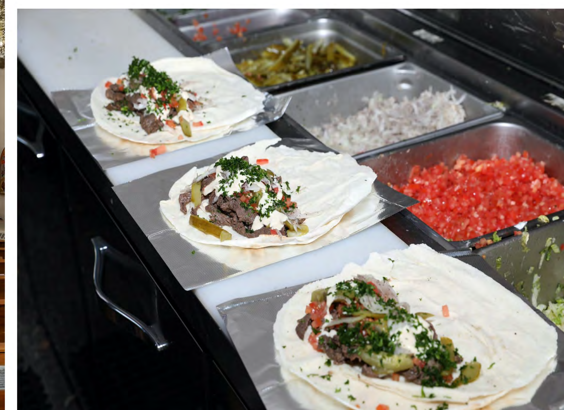
Figure 6. Food served at Middle Eastern Festival in Syracuse.