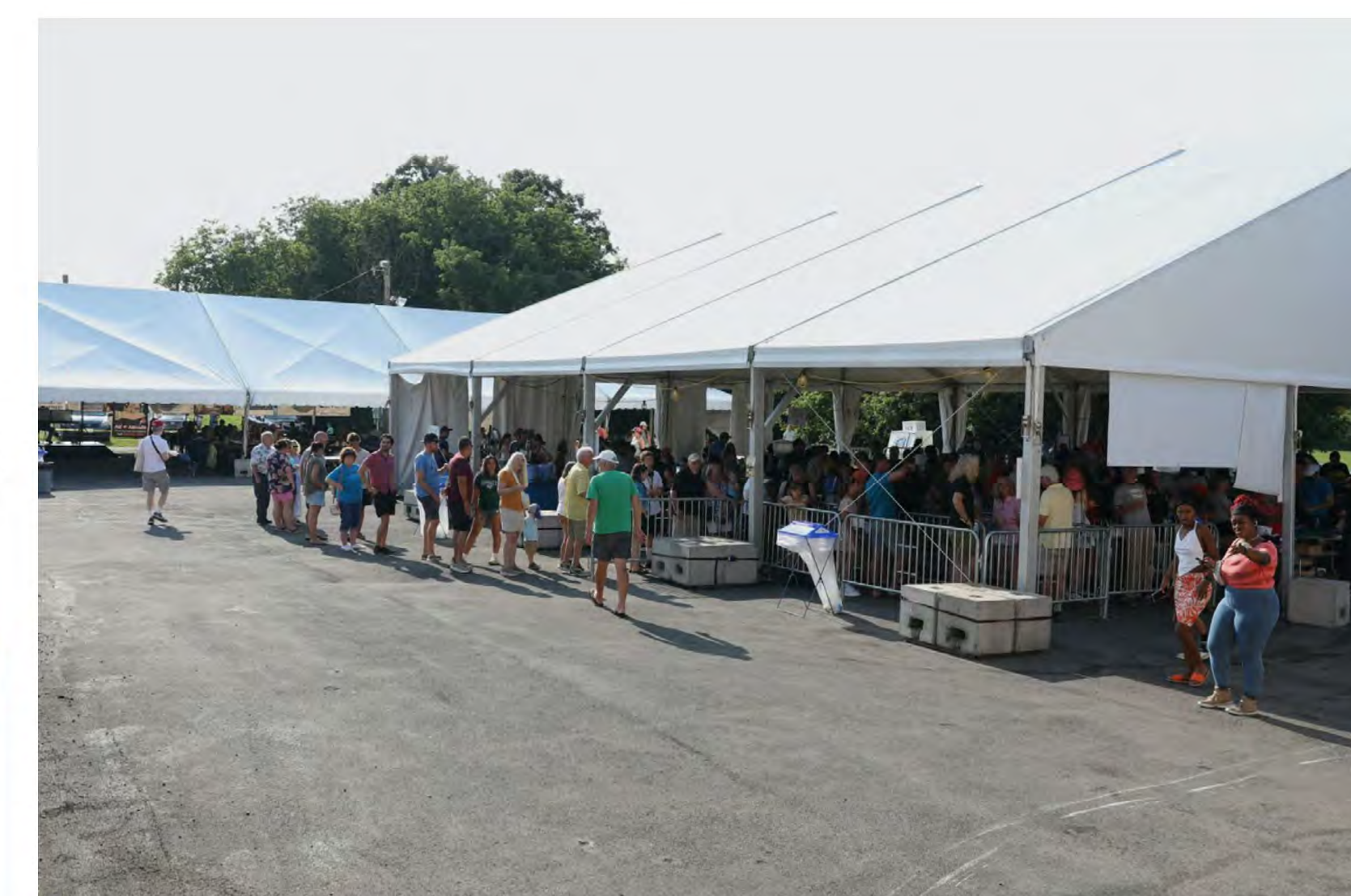
Figure 3. Middle Eastern Festival hosted by St. Elias Orthodox Church in Syracuse.