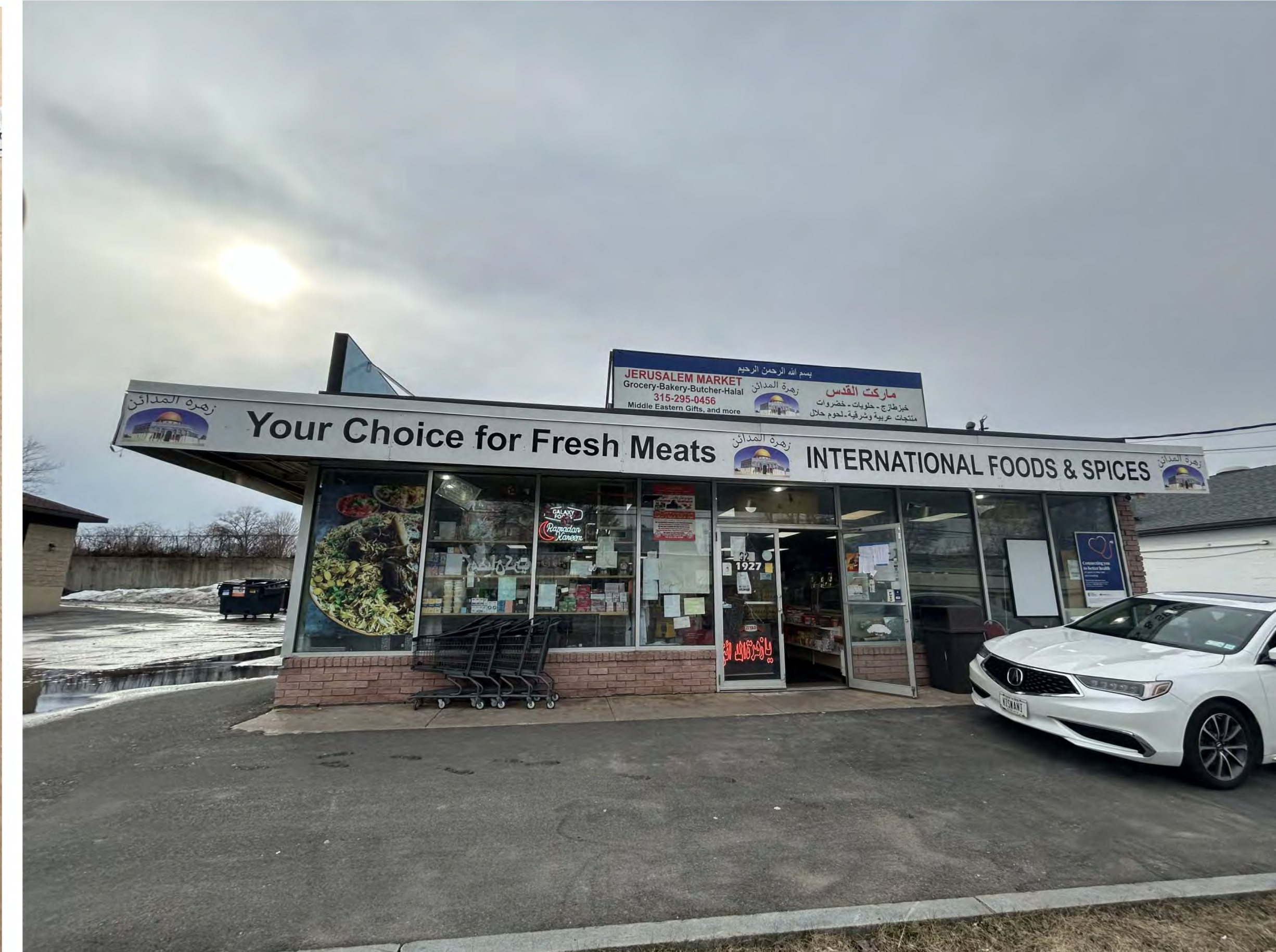
Figure 2. Palestinian-owned Jerusalem Market in Syracuse.