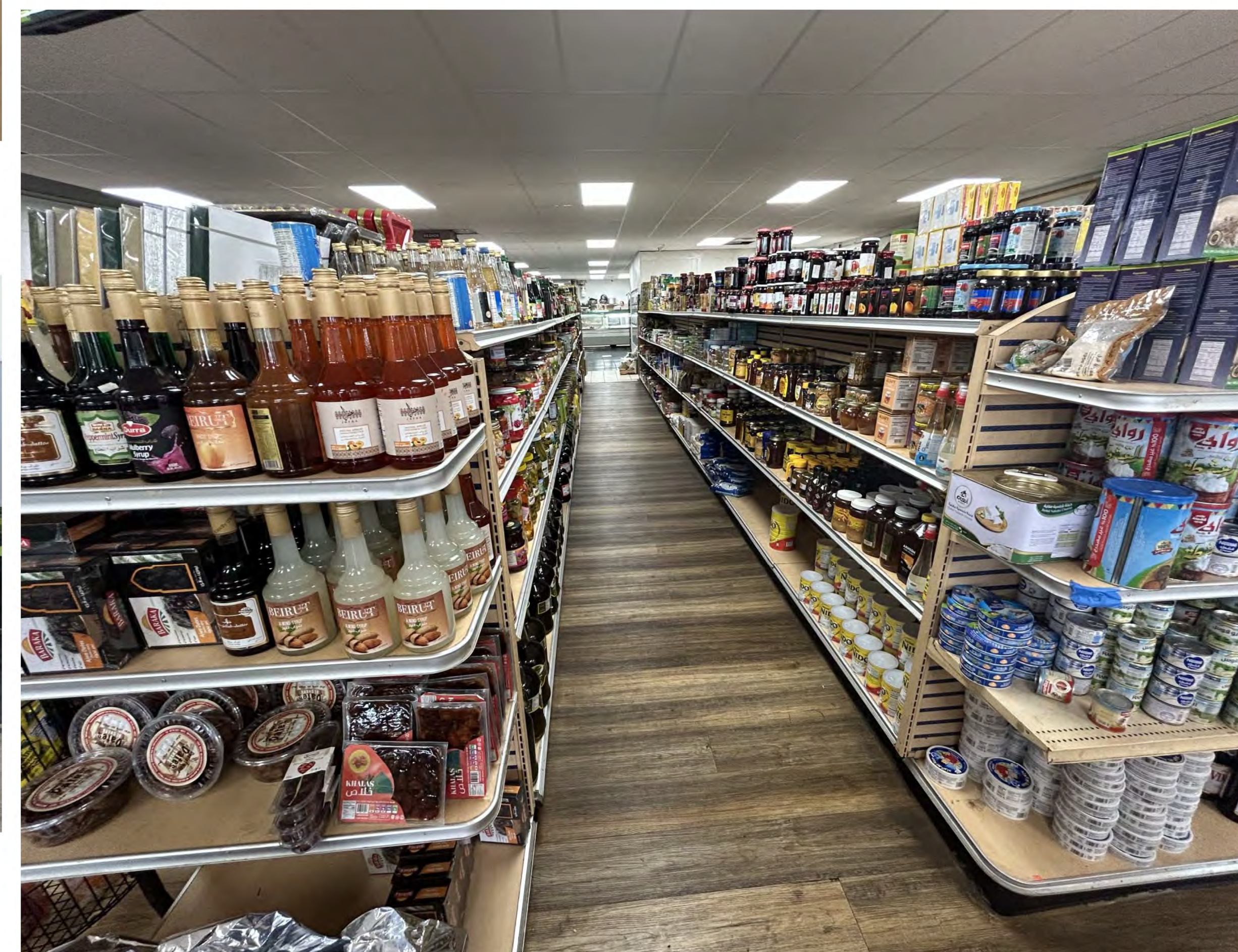
Figure 4. Interior view of Jerusalem Market.