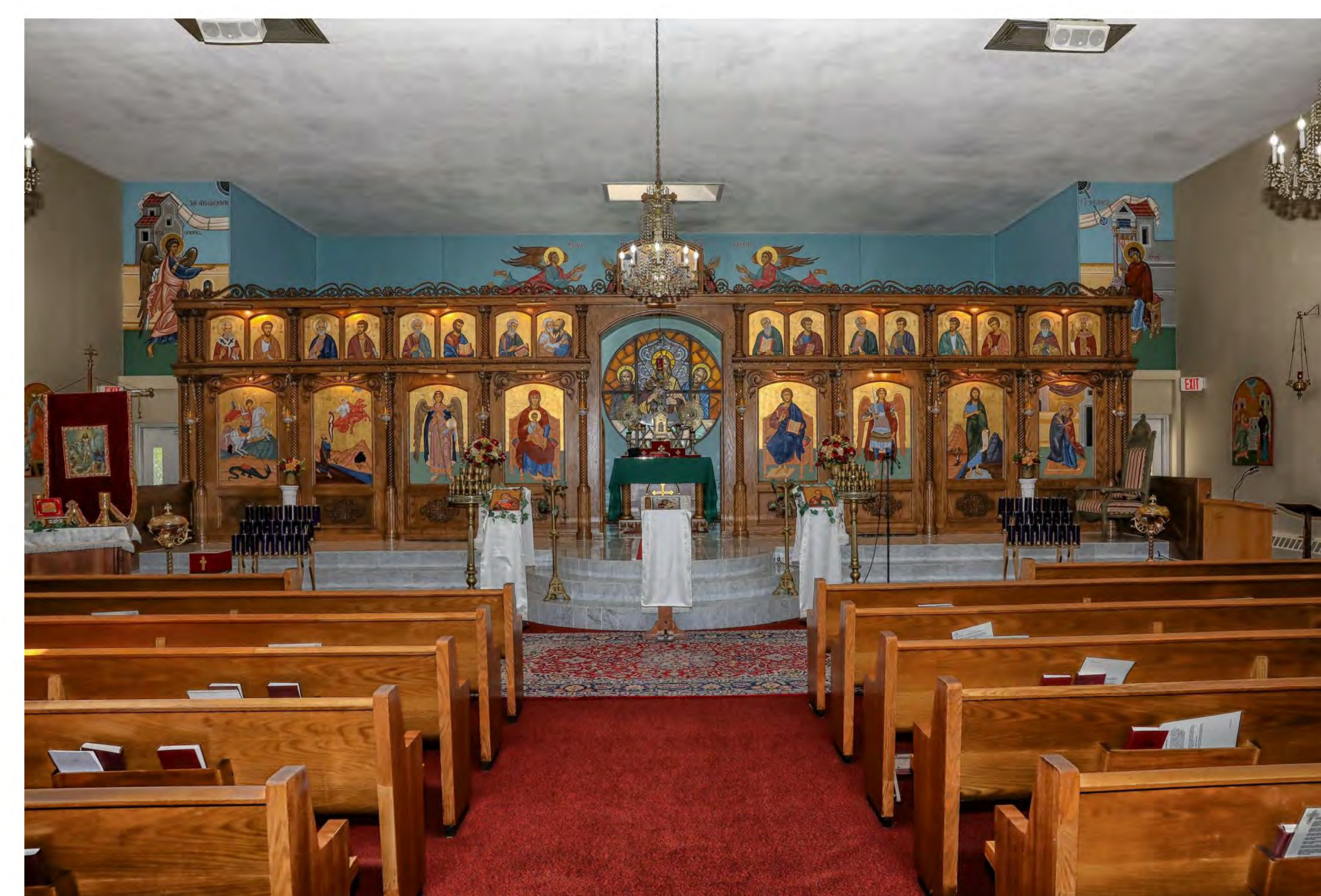
Figure 5. Interior view of St. Elias Orthodox Church in Syracuse.